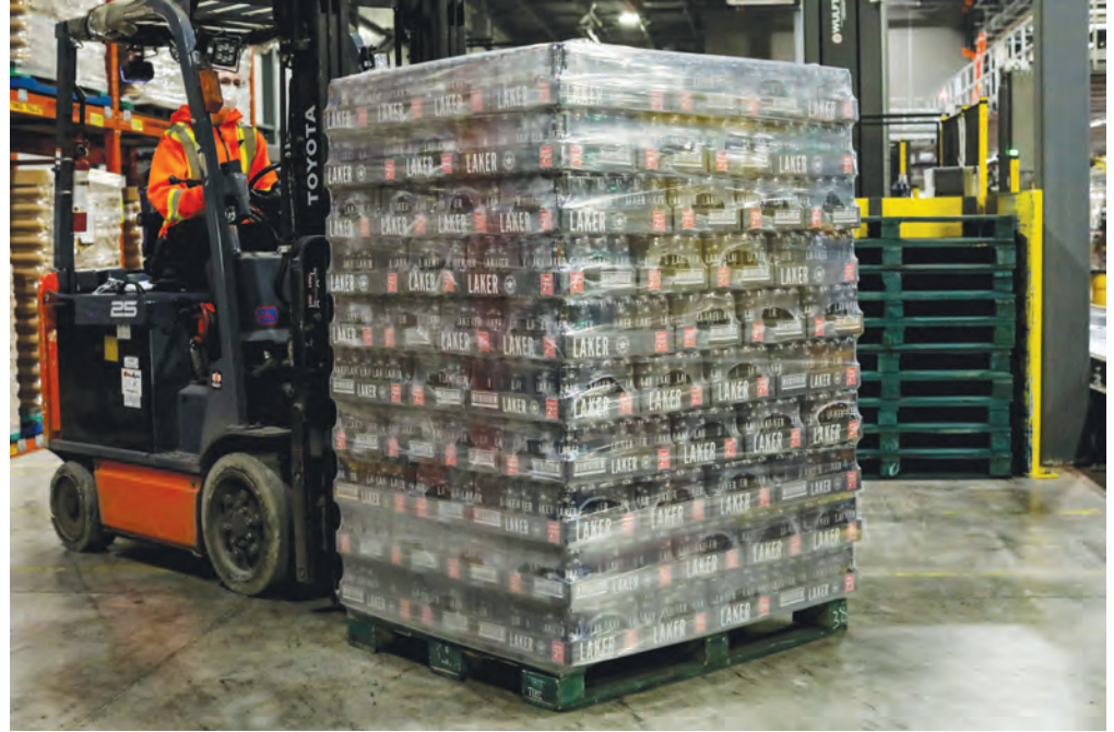
(clockwise) A fully stretchwrapped palletized load of Laker Ice brand beer cans rolls out of the Wulftec model WCA-SMART automatic turntable stretchwrapper and is quickly picked up by forklift to be transferred to the plant's shipping area or storage.